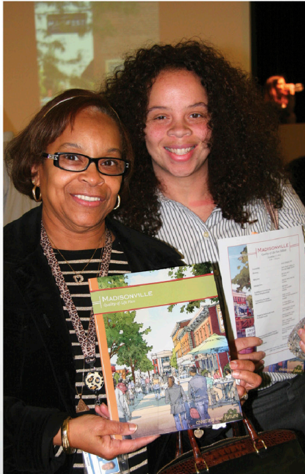
Madisonville residents attending the Quality-of-Life Plan Rollout

Place Matters, which launched in 2007, uses the Building Sustainable Communities model of transformation by addressing issues of housing, economic stability, youth, health and civic engagement simultaneously. There are now five Place Matters neighborhoods, including: