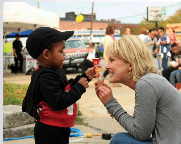
Visitors at the First Annual Cincinnati Street Food Festival in Walnut Hills