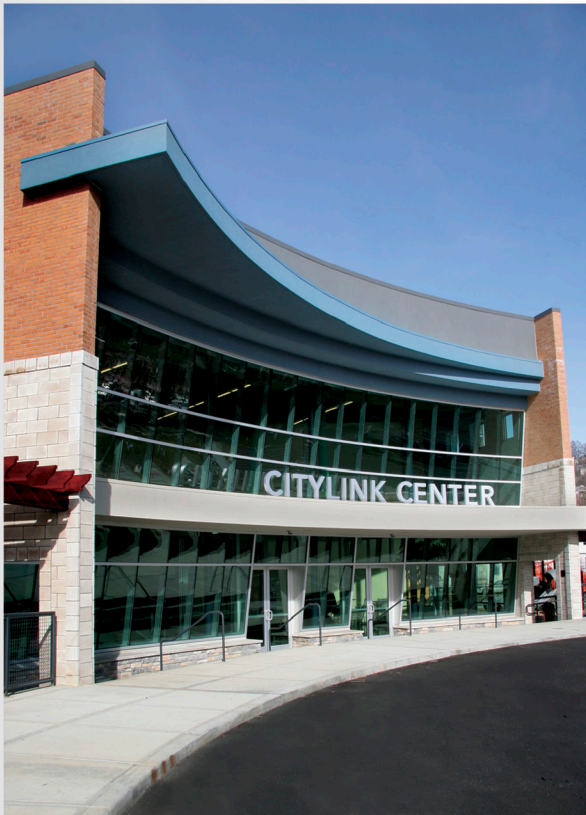
CityLink Center in West End, funded in part by LISC New Markets Tax Credits.