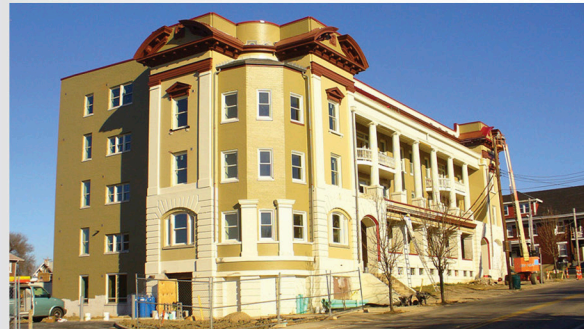
The Elberon in Price Hill, remodeled with NSP funds, opened in 2012.