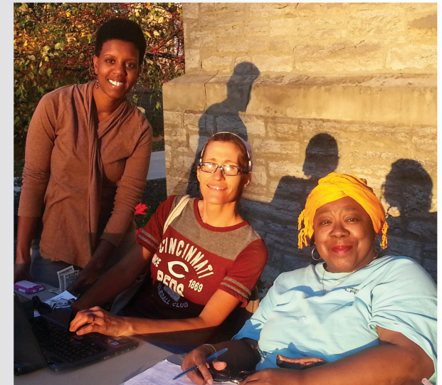
Staff and volunteers at Gabriel's Place market in Avondale