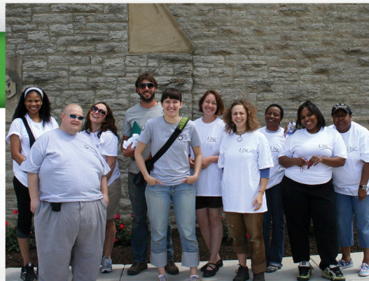
AmeriCorps members with LISC staff

Fourteen LISC AmeriCorps members brought new talent to the community development field in 2012. Agencies with an AmeriCorps member this year included all four FOC sites, the Legal Aid Society of Greater Cincinnati, and Groundwork Cincinnati - Mill Creek.