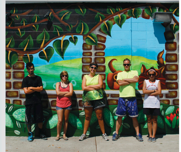
Young artists in front of the Artworks mural in Lower Price Hill